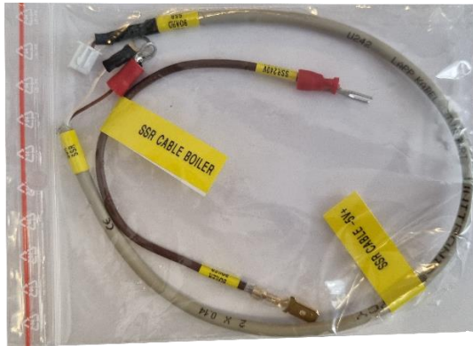
Solid State Reley Cables Bag