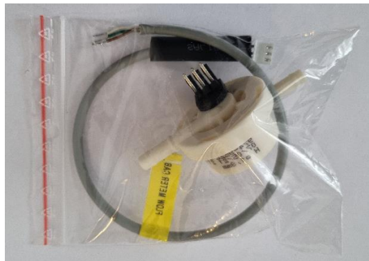
Flow meter Bag