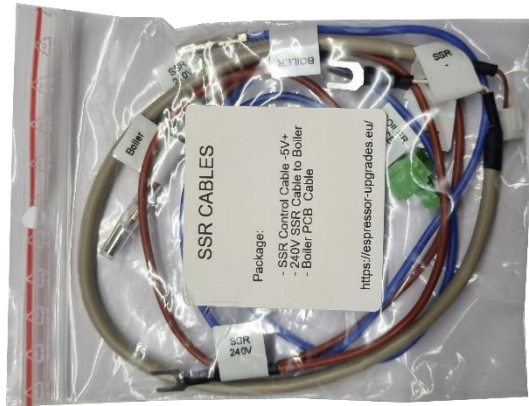
Solid State Relay Cables Bag