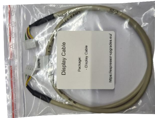
Display Cable Bag