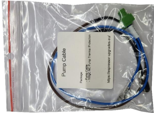
Pump Cable Bag