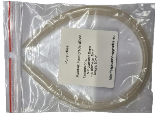
Pump Hose Bag