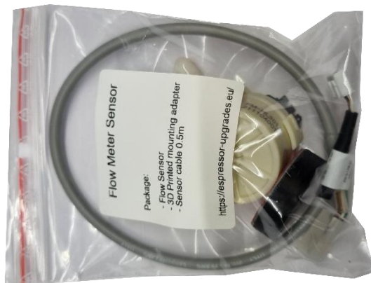
Flow meter Bag